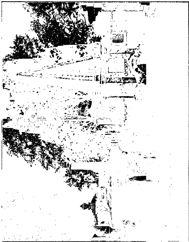
CEMETERY AT BERHAMPORE IN WHICH GEORGE THOMAS IS BURIED.

[From a photograph; The tombstones in the foreground bear inscriptions dated 1802 and 1803; the date of Thomas's death was 1802.]